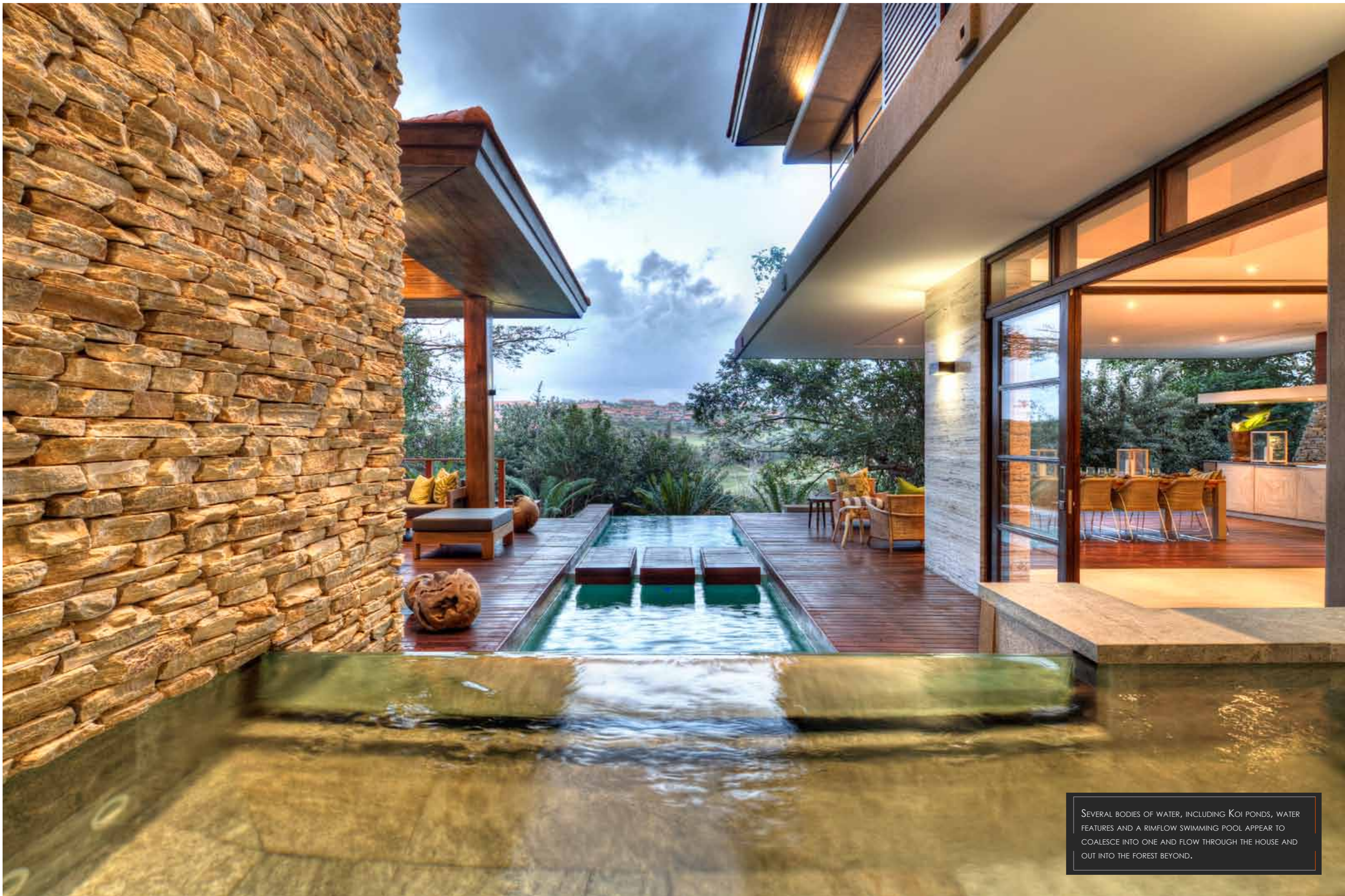
SEVERAL BODIES OF WATER, INCLUDING KOI PONDS, WATER FEATURES AND A RIMFLOW SWIMMING POOL APPEAR TO COALESCE INTO ONE AND FLOW THROUGH THE HOUSE AND OUT INTO THE FOREST BEYOND.