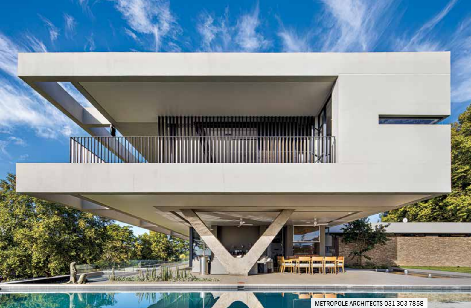
METROPOLE ARCHITECTS 031 303 7858

ABOVE: As the architects on this property, Metropole Architects created a modern home with brutalist undertones that are expressed in the structural design. The property takes on a simple arrangement of monolithic linear forms that project out across the vast manicured lawn and gently sloping paddocks, while still managing to position itself comfortably among the existing mature trees. The home stands out as a bold modernist structure within a rustic country environment, and gives these home owners all they need to enjoy life to the fullest.