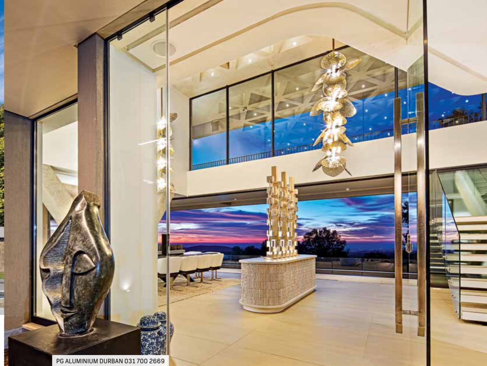
PG ALUMINIUM DURBAN 031 700 2669

ABOVE: Manufacturers and installers of custom-made aluminium products such as windows, doors, balustrades and showers, PG Aluminium Durban supplied and installed various items in this home including the windows, doors, floor-to-ceiling shower screens, main entrance glass pivot door as well as the glass screen for the koi pond. Graphite grey was the colour selected for the aluminium. Double-glazed glass panels were used for some windows, while other windows were installed with standard safety glass – all compliant with AAAMSA glazing regulations.