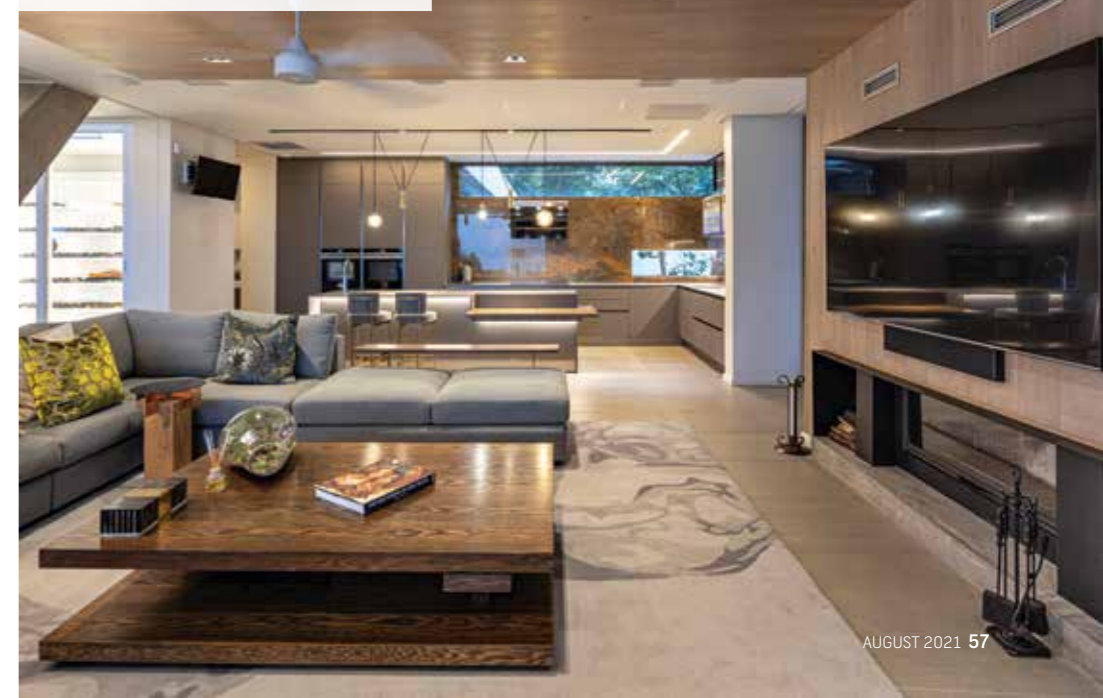
EUROCASA JOHANNESBURG 011 684 2221

“Invest in design – this is the most important factor in the success of the finished product.” – the home owner